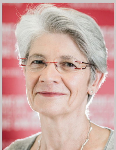
Bernadette Ségol, General Secretary of the ETUC

QUOTE OF THE WEEK "While EU leaders congratulate themselves that the Euro crisis is over, I say that the crisis of unemployment and poverty has yet to be tackled. New policies are needed to get Europe back to work!"