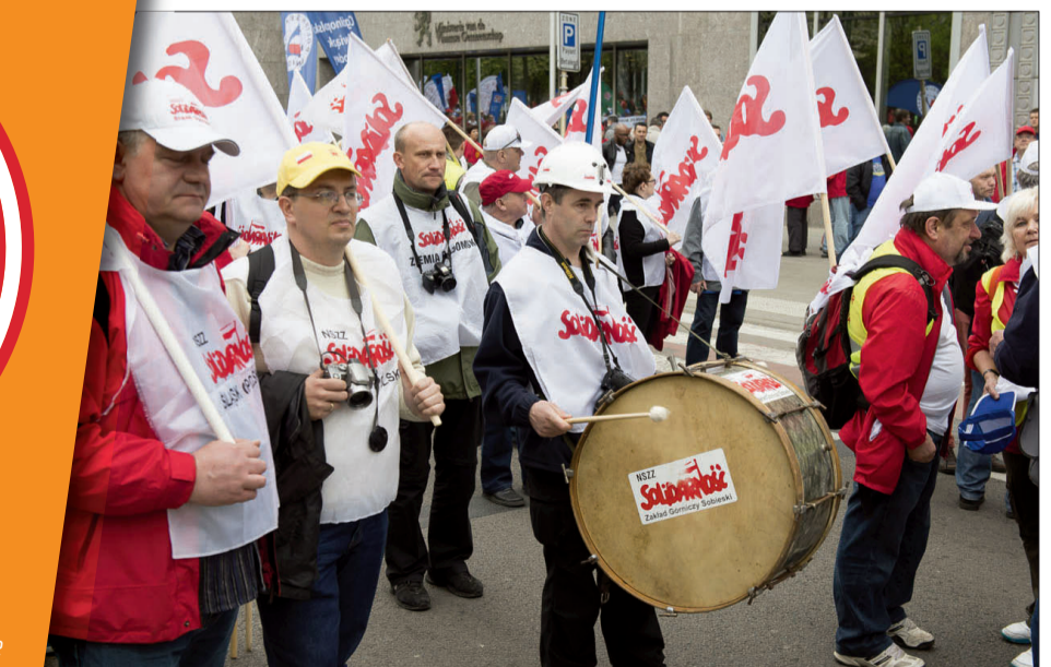
Polish workers demonstrating in Brussels against austerity