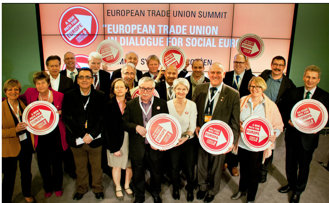
National trade union leaders from all over Europe gathered in Brussels for an unprecedented summit ahead of the European Council on 20 March to call for an end to austerity and for a new path for Europe with a massive investment programme for growth and jobs.