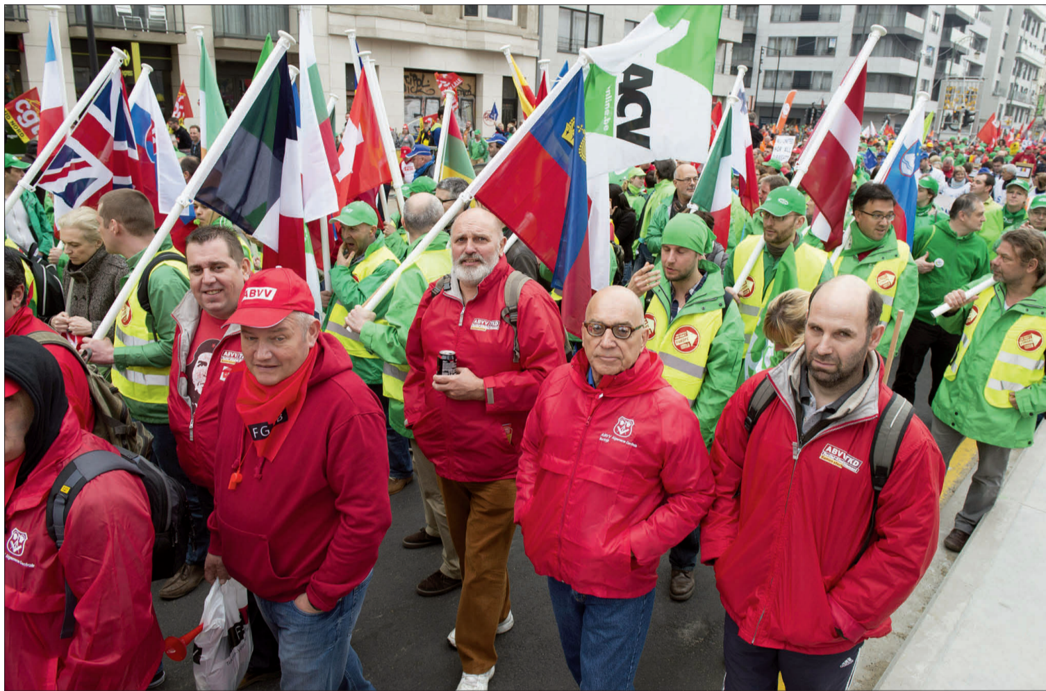
Workers march for investment in jobs and growth