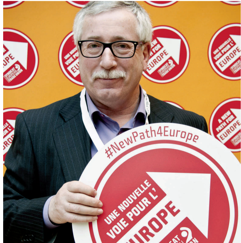
ETUC President Ignacio Toxo