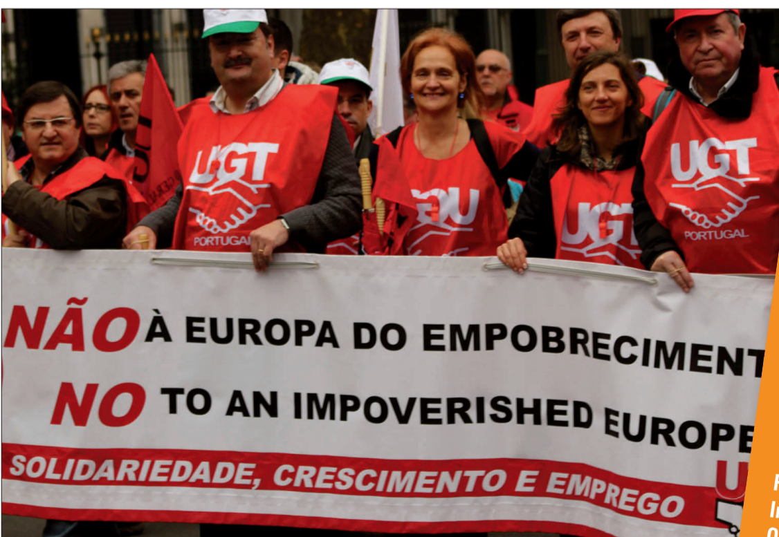
Portuguese trade unionists came to Brussels to demand new EU policies to tackle unemployment and poverty