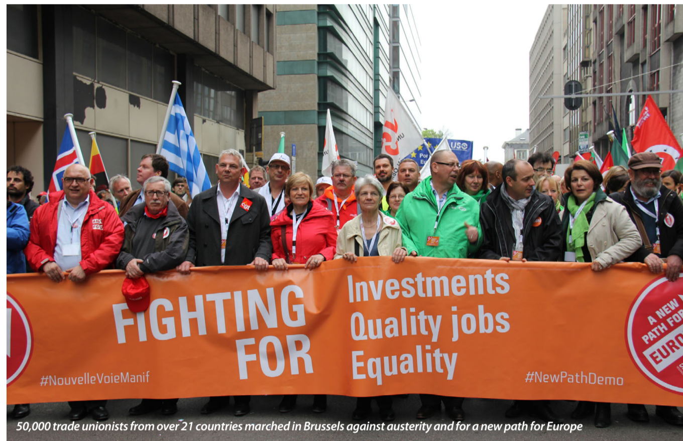
50,000 trade unionists from over 21 countries marched in Brussels against austerity and for a new path for Europe

"Today's policies of cuts and deregulation are failing Europe's citizens," Ségol told Barroso and Van Rompuy. "The ETUC proposes an investment target of 2% of GDP annually over ten years. Such investments would help build a strong industrial base, good public services and innovative